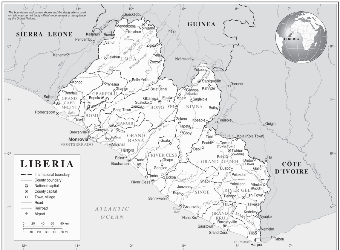
Map No. 3775 Rev. 6 UNITED NATIONS January 2004

slaves from the Americas and the Caribbean, free-born African-Americans, and Africans captured from slave ships on the high seas. 10