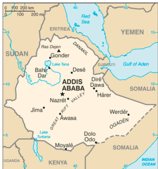
CIA World Factbook

The state surveillance apparatus erected under the Derg continues to result in restrictions on Ethiopians' rights to freedom of association, privacy, movement, and property. Alleged ties to the OLF may serve as justification for arrest, detention, firing, expulsion, or confiscation of property. The government continues to monitor Ethiopians and conduct surveillance through the neighborhood associations, or kebeles , that were established by the Derg and served as the local apparatus of state security. A perception that all communications by phone, post, or e-mail are monitored by the government is nearly universal. New restrictions have been placed on foreign funding of