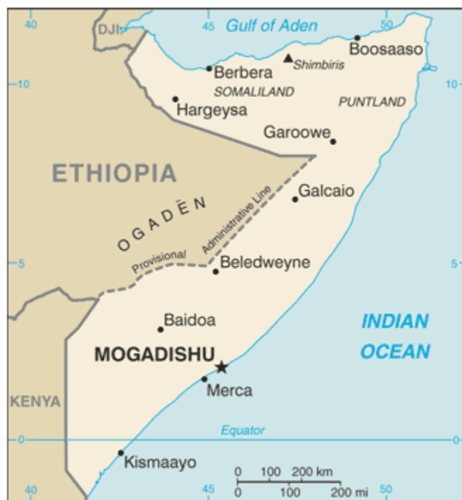
CIA World Factbook

The most substantial Ethiopian intervention into Somali territory occurred in December 2006 when Ethiopia, with U.S. backing, overthrew UIC leadership in Mogadishu. The overthrow led to a spike in violence in Somalia, and has decreased timely prospects for peace in the region. 219 Nonetheless, Ethiopia's strategic position and power