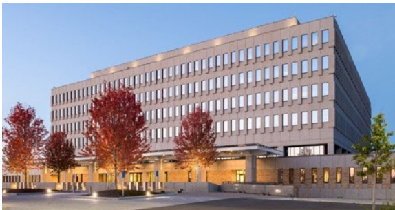
Federal building where immigration court is located.